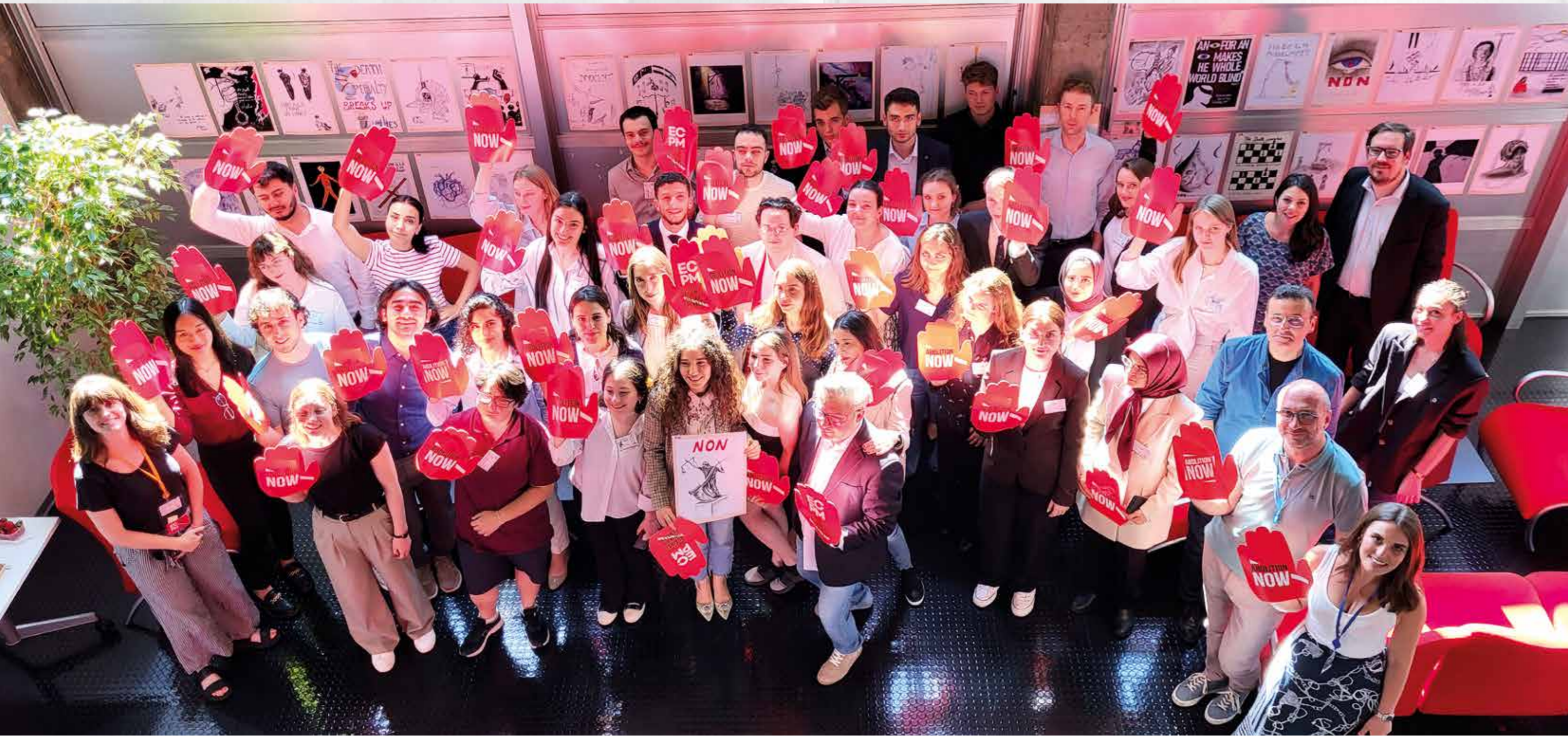
First edition of the youth workshop "Advocacy and awareness-raising for the abolition of the death penalty" organised in June 2023 by the Council of Europe and Together against the death penalty with the support of the Permanent Representation of France to the Council of Europe. 35 participants of 18 different nationalities have initiated reflections and projects in favour of universal abolition, and most of them are meeting again this year for the 2 nd edition.